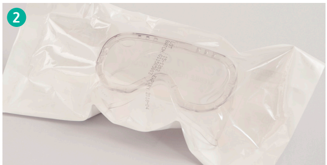
With clean washed hands remove eye protection from their packaging