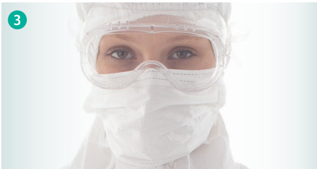
Place goggles over eyes and secure over head with straps/headbands