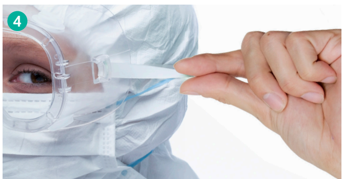
Tighten and adjust to ensure a snug (not tight) fit