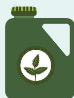
Herbicides: Glyphosate, Paraquat and Diquat