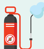
Fumigants: Methyl Bromide