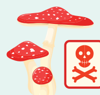
Fungicides: Calcium Polysulfide, Captafol and Captan