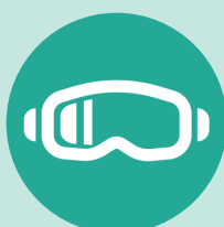
Safety glasses and goggles