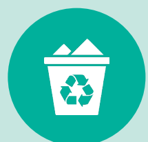
And many more!