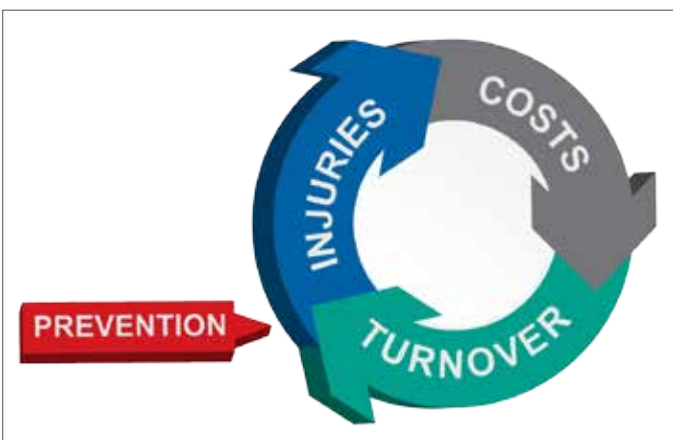
Figure 2: The cycle of injury

Three major interwoven concerns in healthcare safety include: injuries, indirect/direct costs, and employee turnover rates. Workplace injuries lead to high worker's compensation from both direct and indirect sources. Direct costs are made up of the actual healthcare bills, while indirect costs include lost productivity, paying overtime for other employees, finding and hiring temporary or new employees, and retraining. (6) Direct and indirect costs associated with back injuries alone in the healthcare industry are estimated to be $20 billion annually. (3) As new employees replace their injured counterparts, productivity suffers and more work (including the risks associated with the work) are placed on the existing employees. (3) Research conducted by Taylor et al. noted that for every 10 percent increase in turnover, nurse injuries increase by 68 percent. (7) This perpetuates the cycle of injury → costs → turnover as per figure 2. Implementing a preventative program is the most effective method for stopping this cycle with proper training, ergonomics awareness, proper tools and accessibility to assistive technologies.