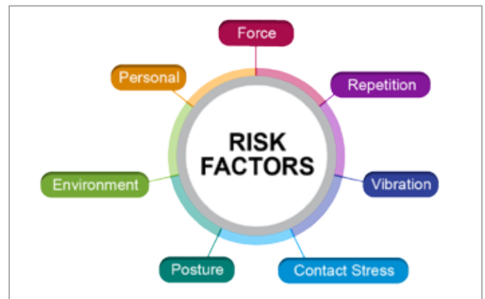
Figure 3: Ergonomic Risk Factors