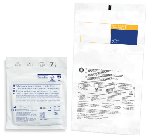
Surgical Glove Sterile Pouch

Additionally, the sterile device packaging must be designed so that neither the sterile device, the recipient, nor the sterile field is inadvertently contaminated in the transfer process. Studies conducted to-date suggest that packaging and the opening process are potential indirect routes for contamination of medical devices. Research that evaluated the effect of pouch size on contamination rates concluded that larger pouches produced higher contamination rates of the contents compared to smaller pouches. 10 Acknowledging this situation, Ansell changed their surgical glove pouch size to a small pouch to reduce risk of inadvertent contamination.