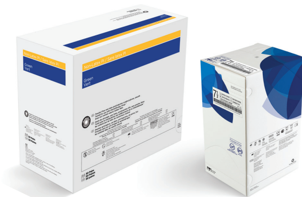
Larger dispenser transition to SMART pack (smaller dispenser)