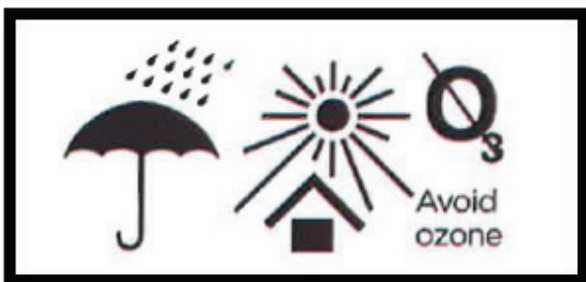
Example of Internationally recognised standards

Gloves should always be stored away from radiators, air outlets or other heat sources and should not be stored long term in areas with temperatures above 90°F/32.2°C, as heat accelerates ozone damage and degradation. Exposure avoidance to these factors, in order not to adversely impact storage life, is indicated in the product packaging (refers to below diagram an example of symbols on product dispenser/carton).