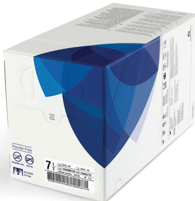
Example of labeling requirements.