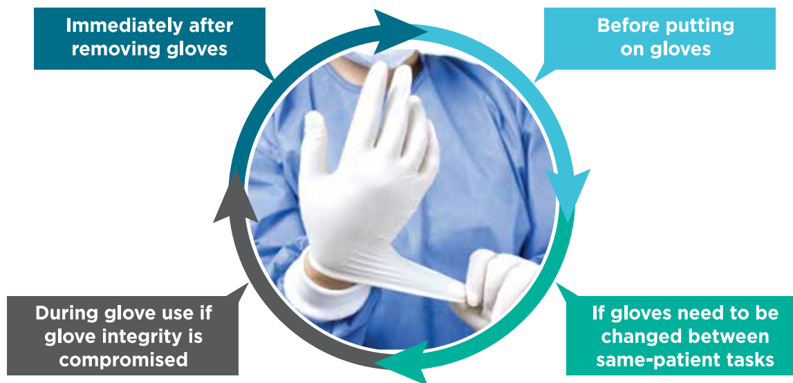
Figure 1: World Health Organization Recommendations