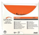
2104 & 2104-H