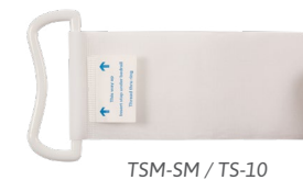
TSM-SM / TS-10

Even the most minor of equipment needs to be paid attention to as it can affect the safety outcome of patients.