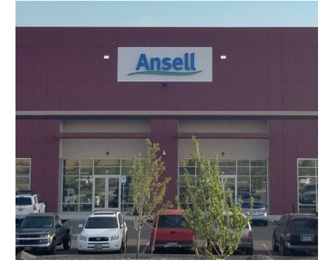
'Safely – that's just how we do things around here.' Safety is top of mind at all Ansell locations, like the Company's newest, state-of-the-art warehouse in Reno, Nevada.