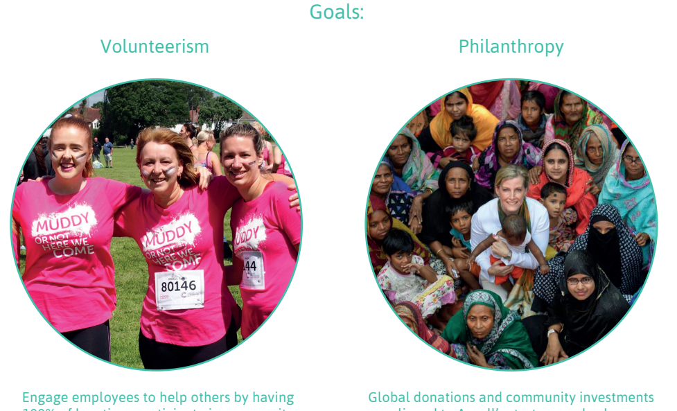
100% of locations participate in community service activities by end of FY21.

Ansell is committed to helping people in need around the globe achieve safety, well-being and peace of mind. By partnering with non-profit organisations, the Company is working with people to develop a sustainable future, and when disaster or disease strike, Ansell steps in to lend a hand.