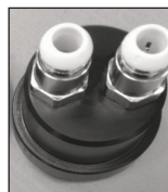
Inflation and detection plug x 1