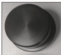
Exhalation sealing plug x 1

The following parts are essential for performing a leak-tightness test on AlphaTec® & MICROCHEM® Gas-Tight suits. Not supplied but also required is 6mm OD air tubes and appropriate connectors for the test unit.