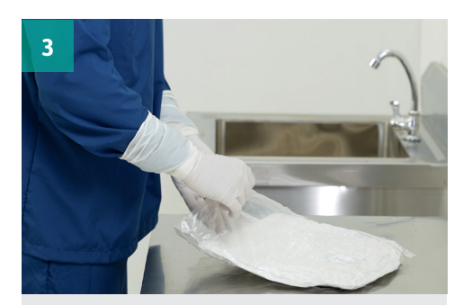
Remove the coverall from the package. You will notice the garment is unzipped and inverted at the waist, while the sleeves and pants are folded-in to ease donning aseptically.