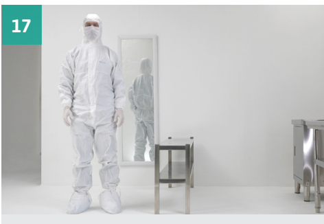
Garment donning is complete.

This donning guide is for guidance only, site protocols and procedures should be followed at all times.