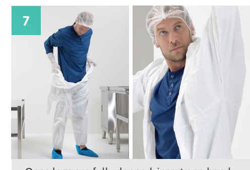
Once legs are fully donned, insert one hand carefully into a sleeve while the other hand brings the other side of the coverall around to the front (like when putting on a shirt). Insert other hand into the other sleeve. Once both hands have been inserted into the sleeves, raise both hands up above your head to fully stretch out the coverall.