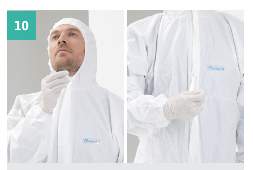
Once the coverall is fully zipped, remove the backing liner and stick the flap over the zipper.