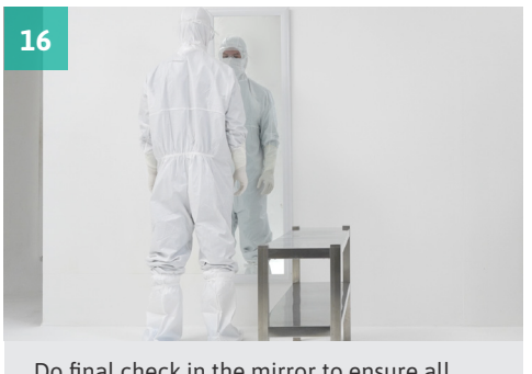
Do final check in the mirror to ensure all apparel fits correctly.