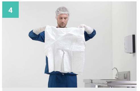
Hold the coverall at the waist to prepare for donning.