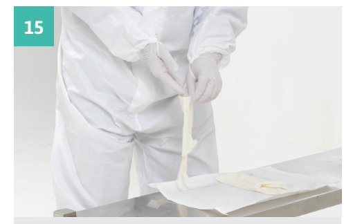
Aseptically don second pair of sterile cleanroom gloves using our sterile glove donning guide, do not touch the outside surface while donning the gloves.