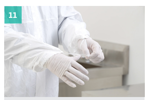
Loop the thumb loop over the thumb, do this for each sleeve.