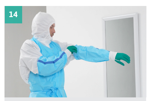
Don sleeve covers following our sterile sleeve cover donning guide.