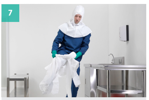
While holding the rolled up interior, don carefully by inserting each leg into the pants/trousers one by one.