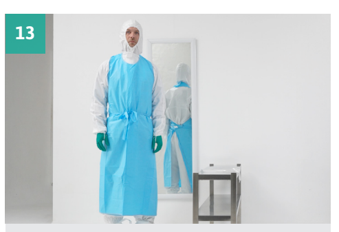
Aseptically don apron.