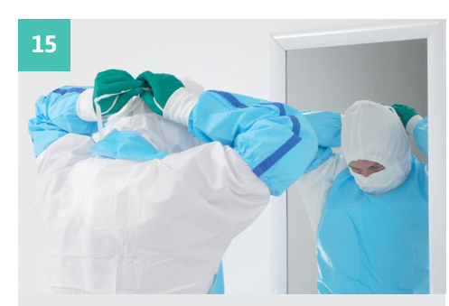
Aseptically don facemask.