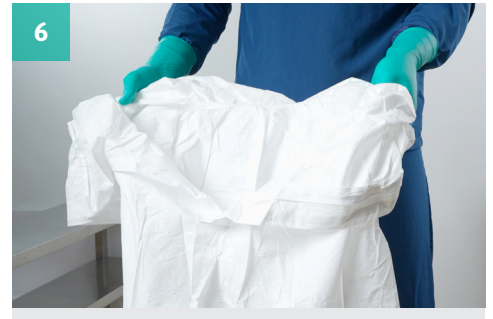
You may choose to roll up the coverall to provide a better grip for easier donning.