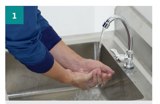
Wash hands, wrists and fingers.