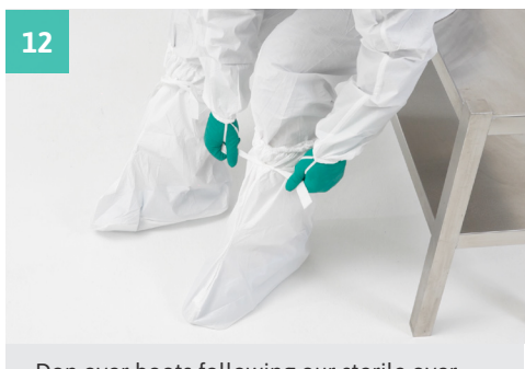
Don over boots following our sterile over boot donning guide.