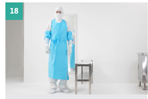
Garment donning is complete.

This donning guide is for guidance only, site protocols and procedures should be followed at all times.