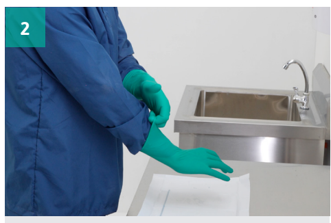
Aseptically don sterile cleanroom gloves, using our sterile glove donning guide, do not touch the outside surface with your barehands. Disinfect gloves after each donning procedure.