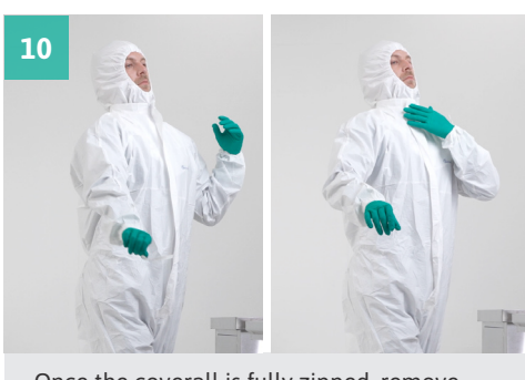
Once the coverall is fully zipped, remove the backing liner and stick the flap over the zipper.