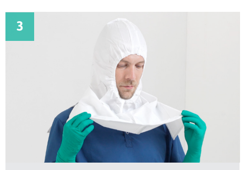
Don the hood using our sterile hood donning guide.