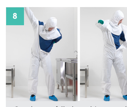
Once legs are fully donned, insert one hand carefully into a sleeve while the other hand brings the other side of the coverall around to the front (like when putting on a shirt). Insert other hand into the other sleeve. Once both hands have been inserted into the sleeves, raise both hands up above your head to fully stretch out the coverall. Tuck the yolk of the hood inside the coverall.