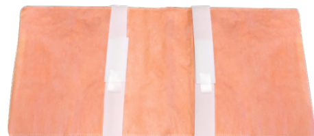
STAT-BLOC Armboard Cover

✈ Contact your Ansell representative for ordering or more information.