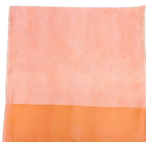
STAT-BLOC Headrest Cover